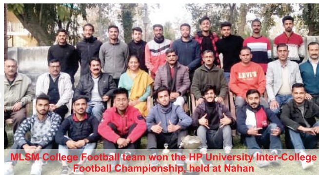
MLSM College Football team won the HP University Inter-College Football Championship, held at Nahan

The college owns a very picturesque and spacious playground with facilities for all major and minor games. The playground has a 400 meter track . Over the years the college has annexed university trophies in Boxing, Kho-Kho, Hockey, Badminton, Wrestling, Cricket, Football and Athletics, both in men & women section.