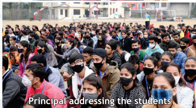
Principal addressing the students