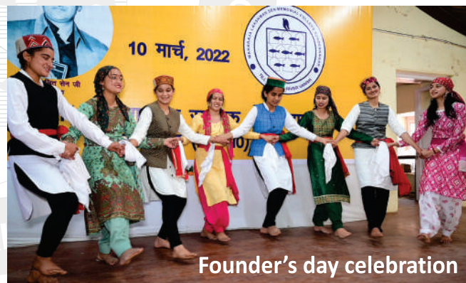
Founder's day celebration

The college lays emphasis on Cultural Activities. Our College get many positions in dance, one act play, mime and other activities during youth festivals. Every year, CSA of the college organizes a two day Cultural Festival “NAVRAS”.