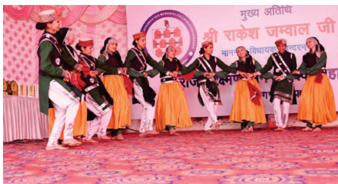
Annual Prize Distribution function