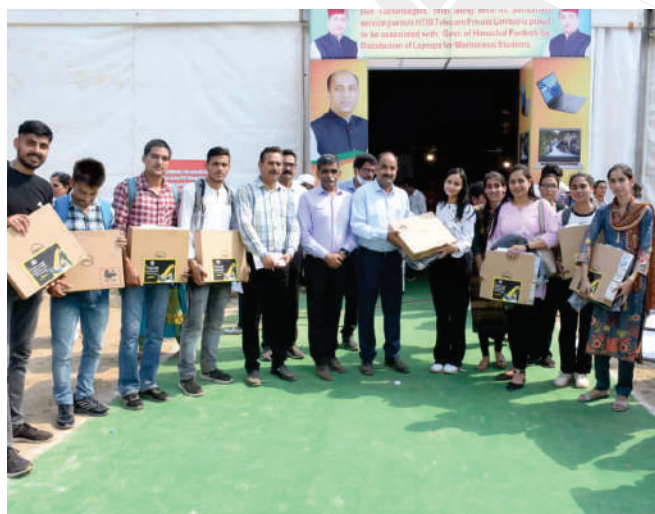
LAPTOPS DISTRIBUTED TO MERITORIOUS STUDENTS BY CHIEF MINISTER, HIMACHAL PRADESH

The college has an illustrious academic record and it has produced a large number of students who have distinguished themselves in the Medical, Engineering, Teaching professions and in the administrative services. This is in addition to those who have joined the Armed Forces, the private sector, and who are successfully self-employed. The students passing out of this institution bear a distinct stamp of discipline and they try to be useful to society as a whole.