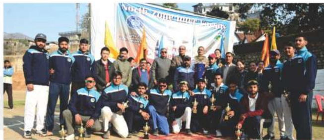
North India Inter-Varsity Cricket Championship (Men) 2023-24

The college owns a very picturesque and spacious playground with facilities for all major and minor games. The playground has a 400 meter track. Over the years the college has annexed university trophies in Boxing, Kho-Kho, Hockey, Badminton, Wrestling, Cricket, Football and Athletics, both in men & women section.