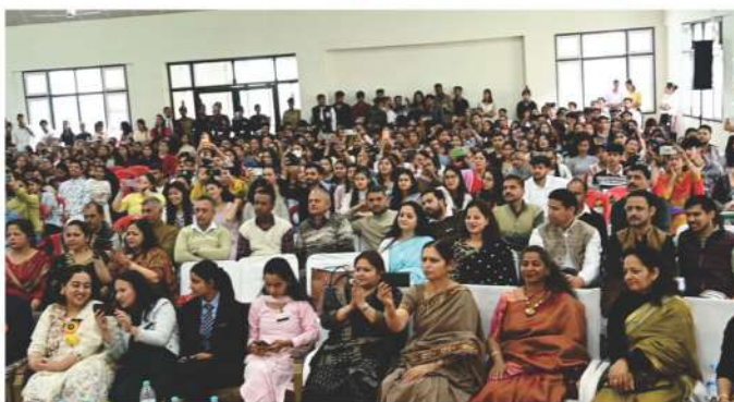
Annual Prize Distribution Function