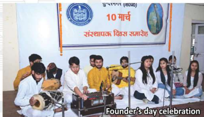
Founder's day celebration

The college lays emphasis on Cultural Activities. Our College get many positions in dance, one act play, mime and other activities during youth festivals. Every year, CSA of the college organizes a two day Cultural Festival "NAVRAS".