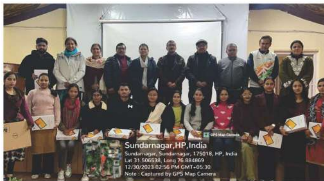
LAPTOPS DISTRIBUTED TO MERITORIOUS STUDENTS BY PRINCIPAL MLSM COLLEGE, SUNDERNAGAR HIMACHAL PRADESH

The college has an illustrious academic record and it has produced a large number of students who have distinguished themselves in the Medical, Engineering, Teaching professions and in the administrative services. This is in addition to those who have joined the Armed Forces, the private sector, and who are successfully self-employed. The students passing out of this institution bear a distinct stamp of discipline and they try to be useful to society as a whole.